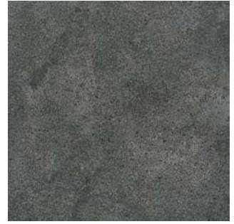
E2MP04-24S Mashup Road Structure 23.5" x 23.5" x 20mm Sq. Ft.: $17.48 – Pc.: $67.82 *DISCONTINUED - CHECK STOCK*