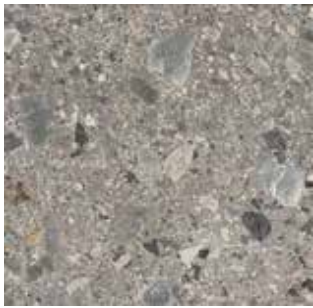
E2RR05-24S Norr Farge Structure 23.5" x 23.5" x 20mm Sq. Ft.: $17.48 – Pc.: $67.82

24"x24" Packing: 2pcs. (7.76 sq. ft.) per carton. Weight: 34.5 lbs. each, 69 lbs. per carton.