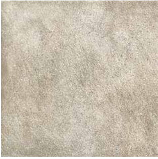
E2MP02-24S Mashup Way Structure 23.5" x 23.5" x 20mm Sq. Ft.: $17.48 – Pc.: $67.82 *DISCONTINUED - CHECK STOCK*