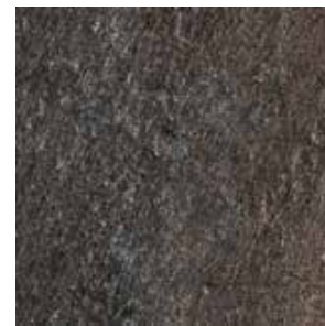
E2QR01-24S Quarzit Glacier Structure 23.5" x 23.5" x 20mm Sq. Ft.: $17.48 – Pc.: $67.82