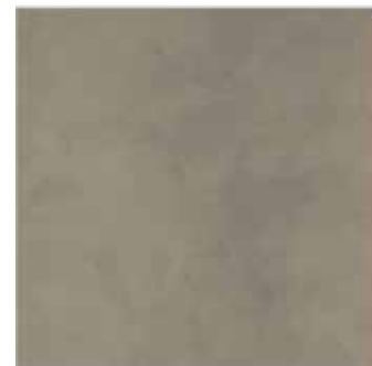
E2CL02-32S Clay Delight Structure 31.5" X 31.5" Sq.Ft.: $16.95 - Pc.: $116.79