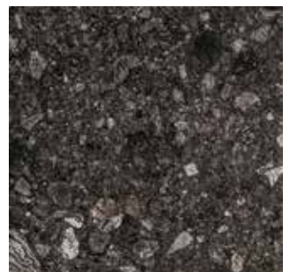
E2RR03-24S Norr Svart Structure 23.5" x 23.5" x 20mm Sq. Ft.: $17.48 – Pc.: $67.82