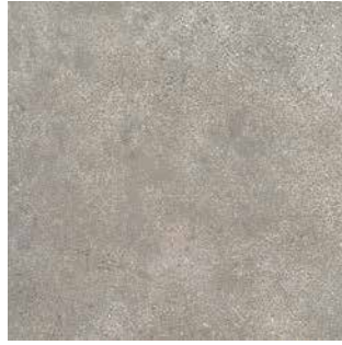
E2MP03-24S Mashup Block Structure 23.5" x 23.5" x 20mm Sq. Ft.: $17.48 – Pc.: $67.82 *DISCONTINUED - CHECK STOCK*