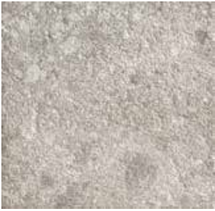
E2RR01-24S Norr Vit Structure 23.5" x 23.5" x 20mm Sq. Ft.: $17.48 – Pc.: $67.82