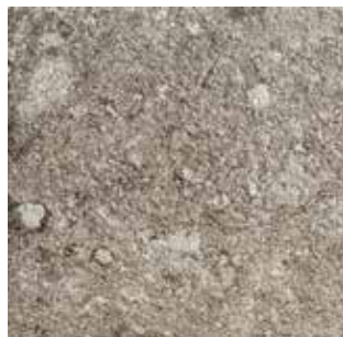
E2ERR02-24S Norr Gra Structure 23.5" x 23.5" x 20mm Sq. Ft.: $17.48 – Pc.: $67.82