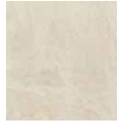
CLU24P Luxor Semi-Polished 23.5 X 23.5 Sq.Ft.: $9.98-Pc.: $38.62