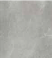
CTR24P Trend Semi-Polished 23.5 X 23.5 Sq.Ft.: $9.98-Pc.: $38.62