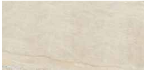
CLU2448N Luxor Natural 23.5 X 47.25 Sq.Ft.: $11.98-Pc.: $92.85