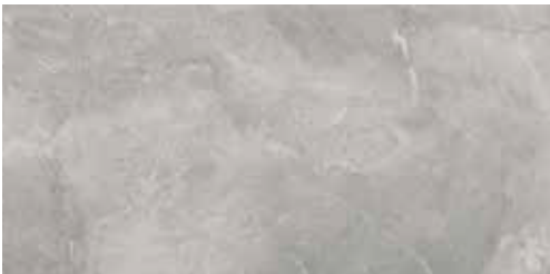
CTR2448N Trend Natural 23.5 X 47.25 Sq.Ft.: $11.98-Pc.: $92.85