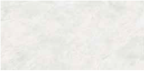
CDA2448N Dakota Natural 23.5 X 47.25 Sq.Ft.: $11.98-Pc.: $92.85