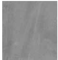
CRO24P Rocky Semi-Polished 23.5 X 23.5 Sq.Ft.: $9.98-Pc.: $38.62