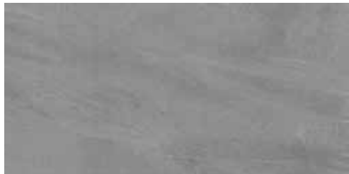
CRO2448N Rocky Natural 23.5 X 47.25 Sq.Ft.: $11.98-Pc.: $92.85