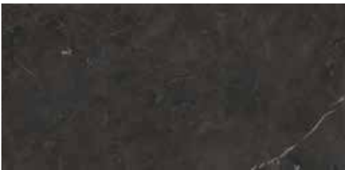
CIM2448N Imperial Natural 23.5 X 47.25 Sq.Ft.: $11.98-Pc.: $92.85