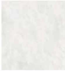
CDA24P Dakota Semi-Polished 23.5 X 23.5 Sq.Ft.: $9.98-Pc.: $38.62