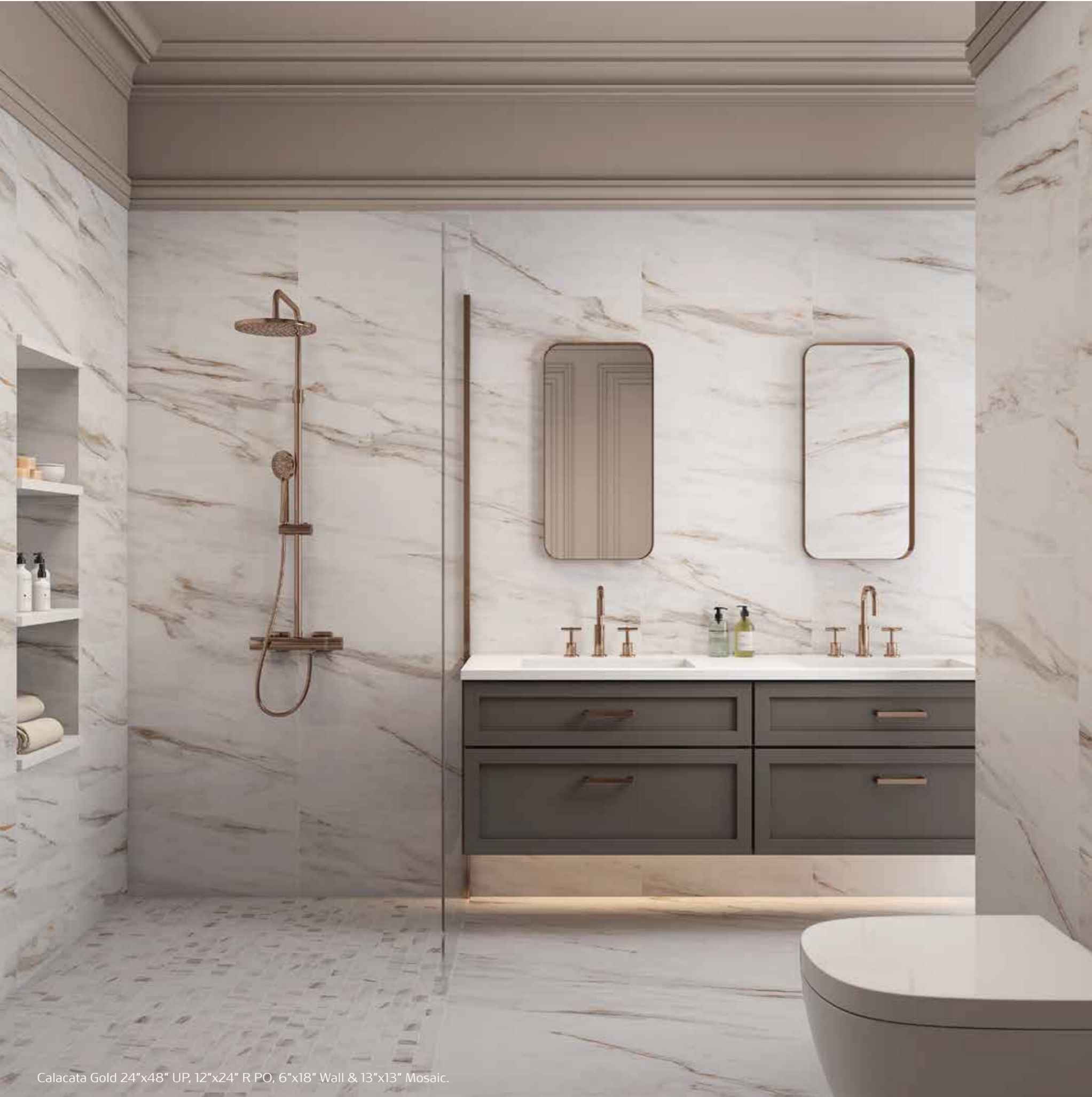
Calacata Gold 24"x48" UP, 12"x24" R PO, 6"x18" Wall & 13"x13" Mosaic.

The Calacata Gold generates unique atmospheres and bright spaces offering a balance between the matte and polished finishes. Also adding warmth through its gold veining, making way for versatile combinations of elements.