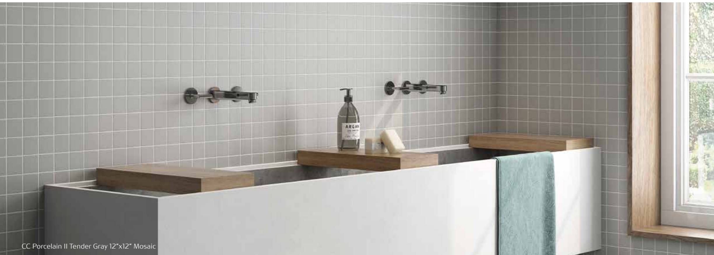
CC Porcelain II Tender Gray 12"x12" Mosaic