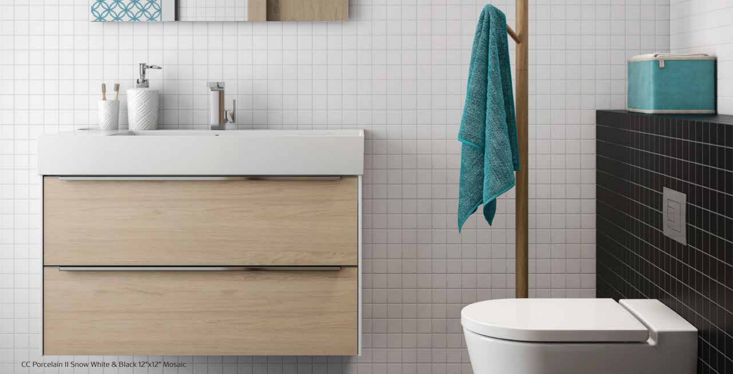
CC Porcelain II Snow White & Black 12"x12" Mosaic