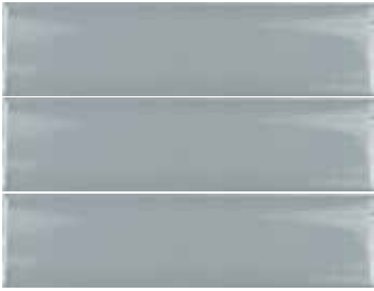
UCOMISBG312 Mist Bright 3" x 12" Sq. Ft.: $9.10 Pc.: $2.30