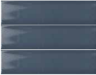
UCOPETBG312 Petrol Bright 3" x 12" Sq. Ft.: $9.10 Pc.: $2.30

3" x 12" packing: 50 pcs. (12.64 sq. ft.) per carton, Weight: 27.67 lbs. per carton