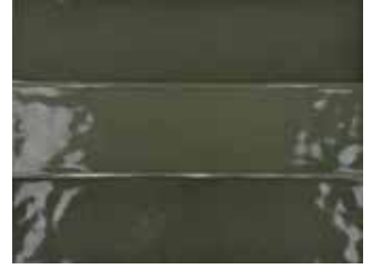
UBTGLABG312 Glasgow Bright 3" x 12" Sq. Ft.: $9.25 Pc.: $2.34