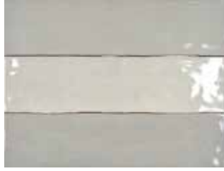
UBTOSLBG312 Oslo Bright 3" x 12" Sq. Ft.: $9.25 Pc.: $2.34