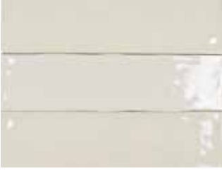
UBTNUUBG312 Nuuk Bright 3" x 12" Sq. Ft.: $9.25 Pc.: $2.34