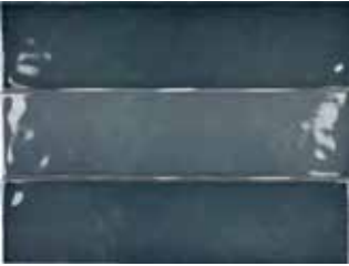
UBTHAVBG312 Havre Bright 3" x 12" Sq. Ft.: $9.25 Pc.: $2.34