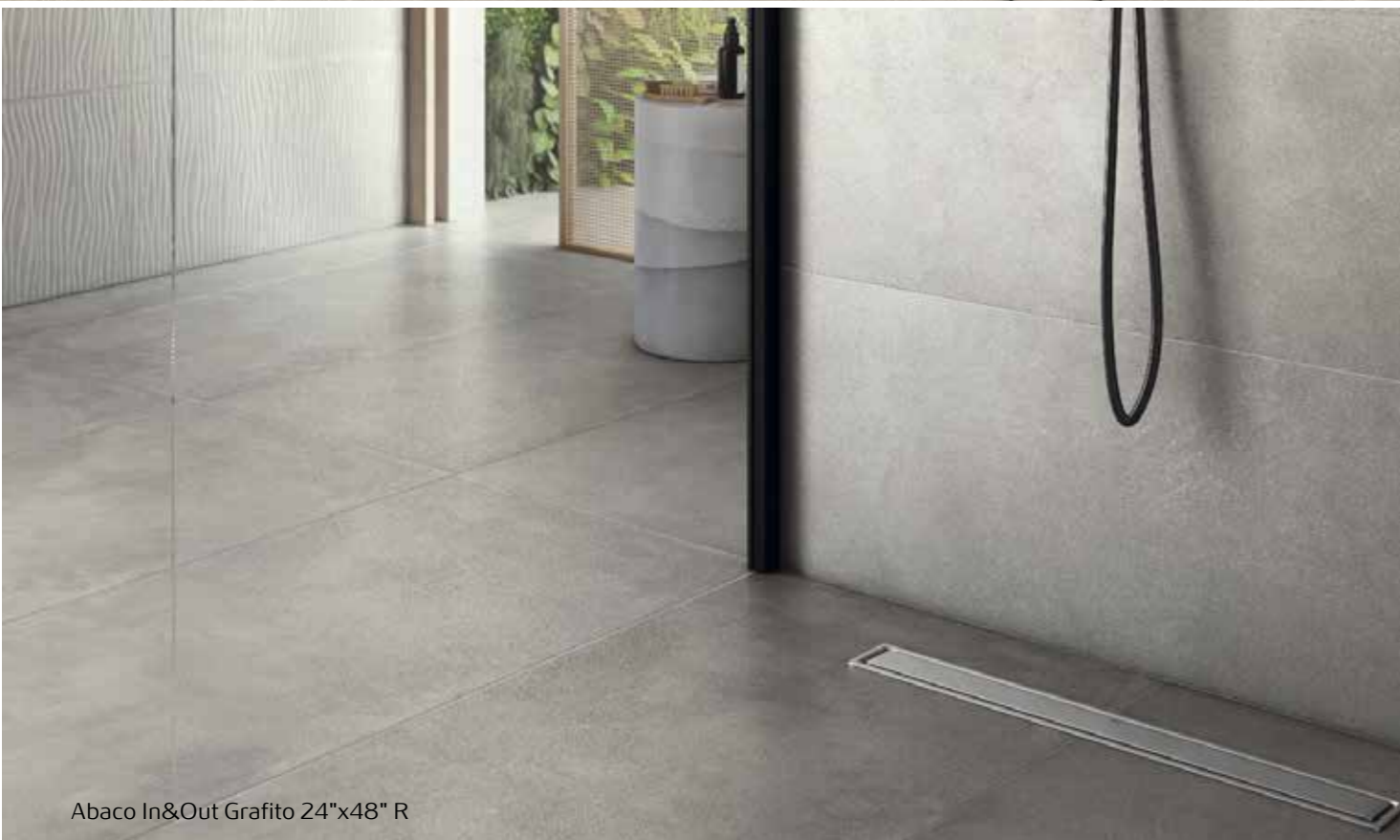
Abaco In&Out Grafito 24"x48" R