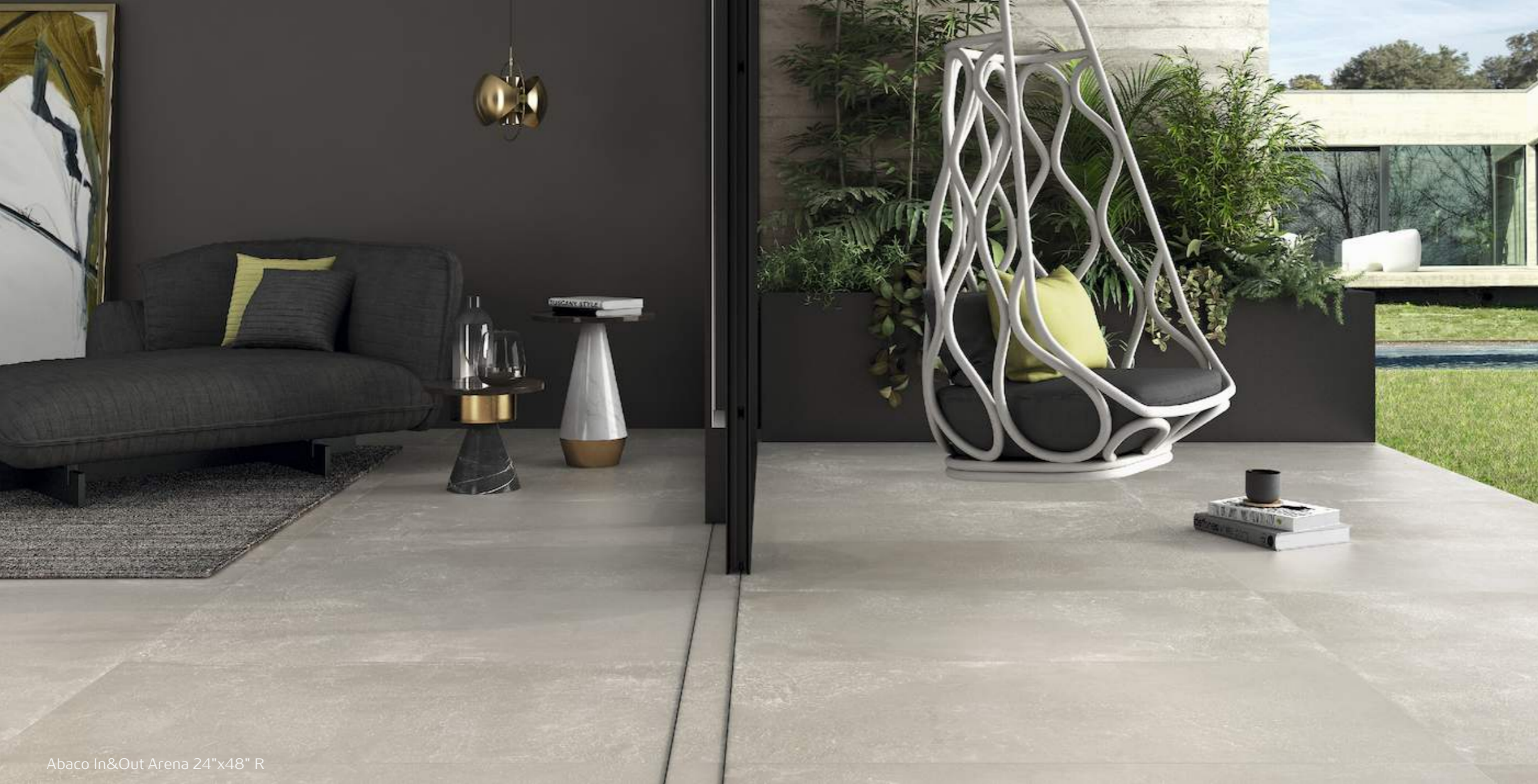
Abaco In&Out Arena 24"x48" R