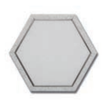
Next Hex Thassos (H) w/ White Terrazzo & Stainless Steel MB1232-HEX8H2