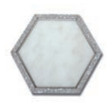
Next Hex Carrara Bella (H) w/ Gray Terrazzo & Stainless Steel MB1604-HEX8H2