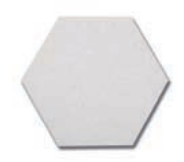
Next Hex Thassos (H) MB1232-HEX8H0