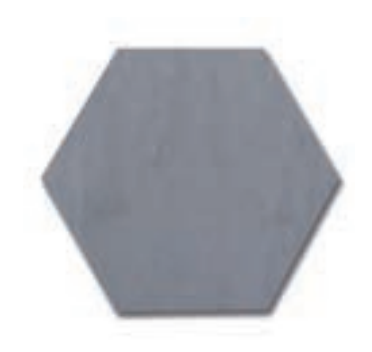
Next Hex Ombra (H) MB2426-HEX8HO