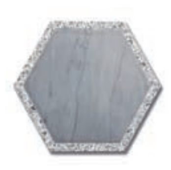
Next Hex Ombra (H) w/ Shadow Terrazzo MB2426-HEX8H1