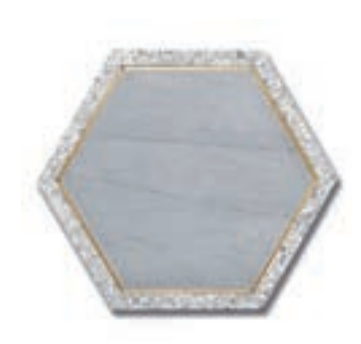
Next Hex Ombra (H) w/ Shadow Terrazzo & Brass MB2426-HEX8H2