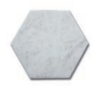
Next Hex Carrara Bella (H) MB1604-HEX8H0