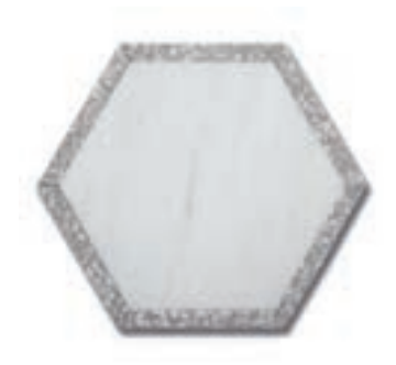
Next Hex Carrara Bella (H) w/ Gray Terrazzo MB1604-HEX8H1