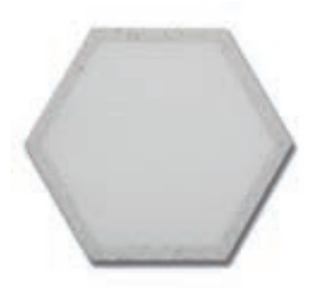
Next Hex Thassos (H) w/ White Terrazzo