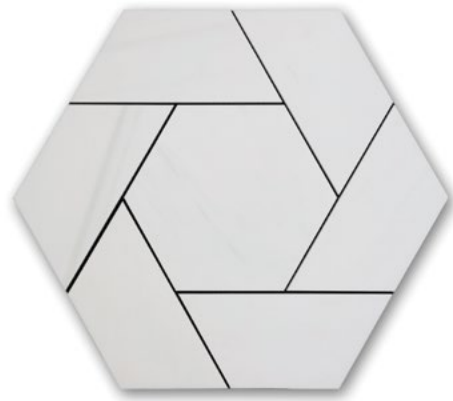
Convex Dolomite (H)