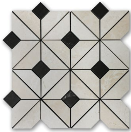
Aura French Vanilla with Tulip Black (H) MB1229-INAU00