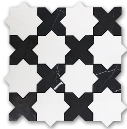
Sun Tulip Black with Dolomite (H) MB1187-SUN000