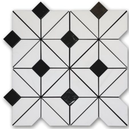
Aura Dolomite with Tulip Black (H) MB1796-INAU01