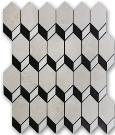
Moment French Vanilla with Dolomite & Tulip Black (H)