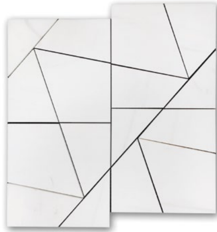
Intuition Dolomite (H)