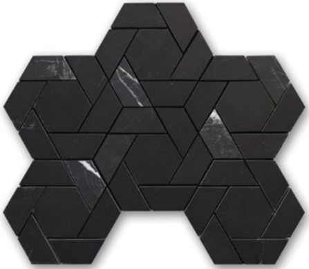
Vortex Tulip Black (H) MB1187-VRTX00