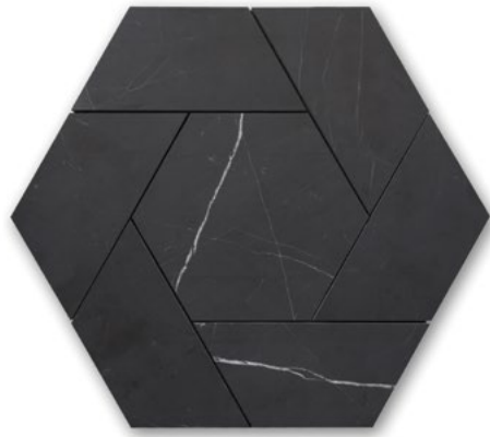
Convex Tulip Black (H)