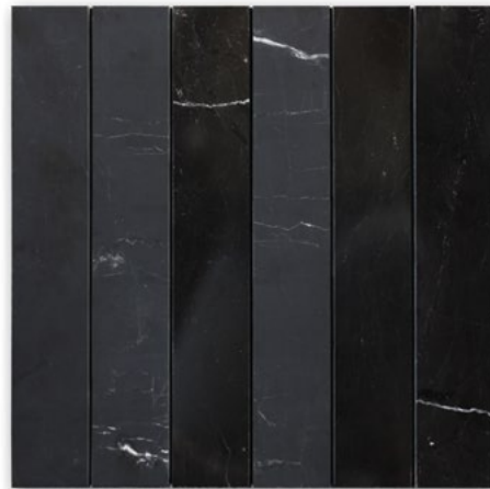
Matrix Tulip Black (H & P)*