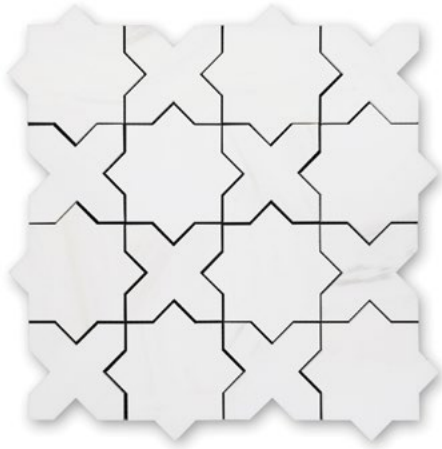
Sun Dolomite (H) MB1796-SUN000