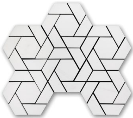
Vortex Dolomite (H) MB1796-VRTX00