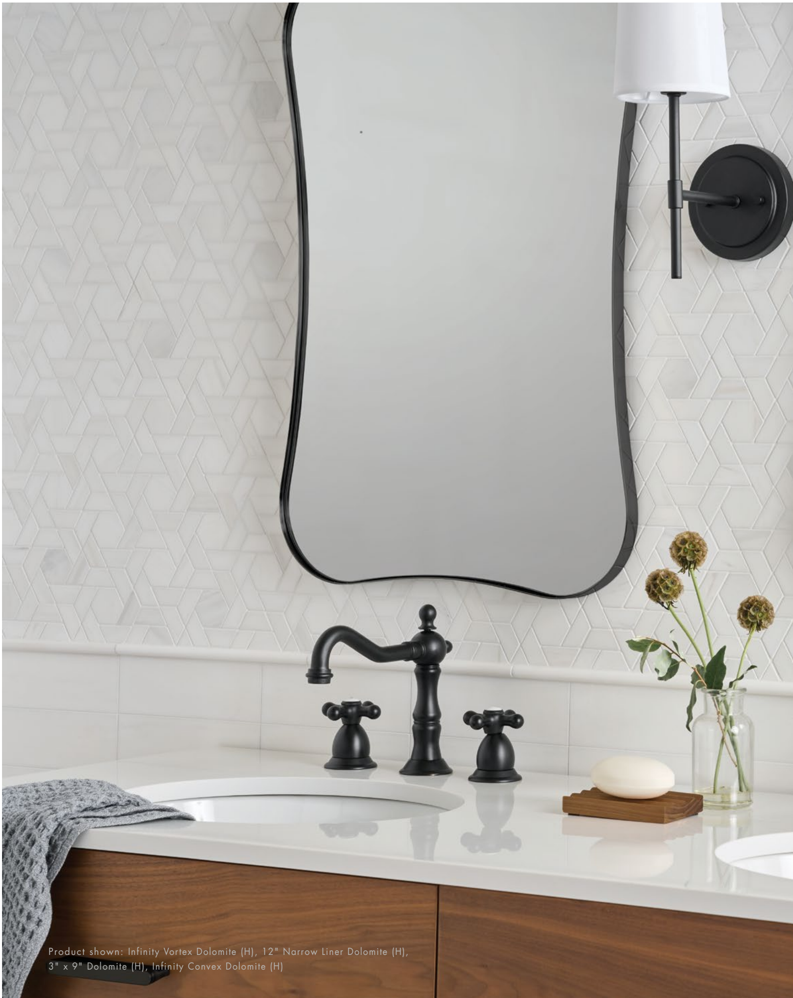
Product shown: Infinity Vortex Dolomite (H), 12" Narrow Liner Dolomite (H), 3" x 9" Dolomite (H), Infinity Convex Dolomite (H)