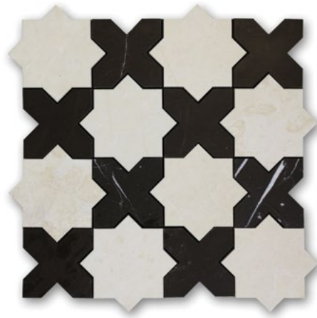
Sun French Vanilla with Tulip Black (H) MB1229-SUN000