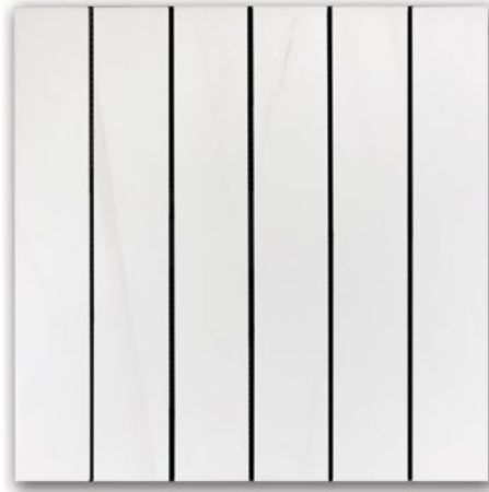
Matrix Dolomite (H)