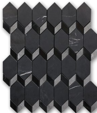
Moment Tulip Black (H, P, & SB)