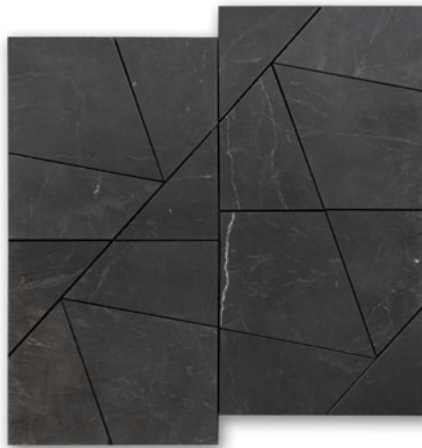
Intuition Tulip Black (H)