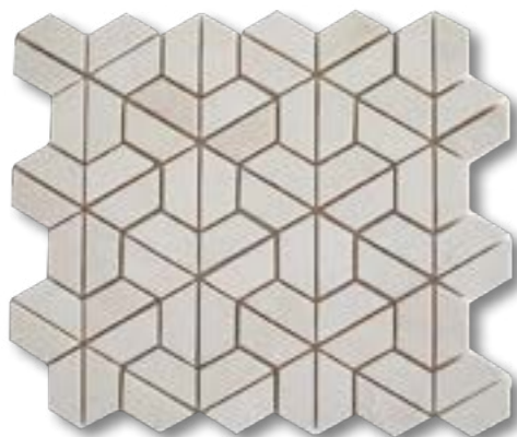
Hoshi French Vanilla