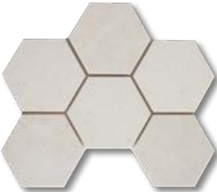
Hexagon 37/8" French Vanilla