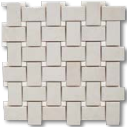
Basket Weave French Vanilla w/ Thassos