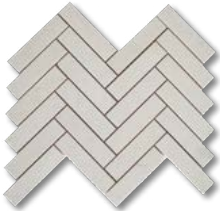
1" x 4" Herringbone French Vanilla