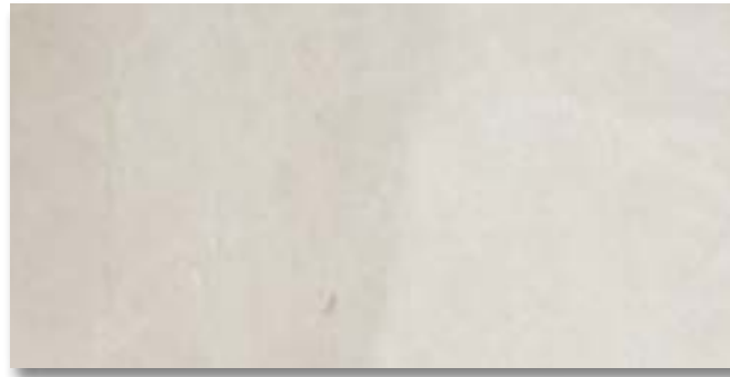
12" x 24" French Vanilla