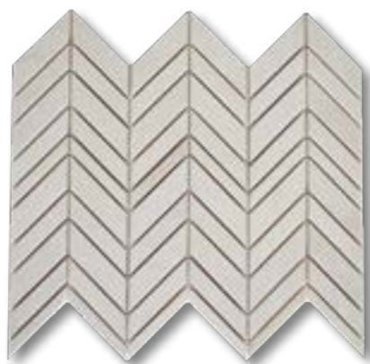
Nami French Vanilla