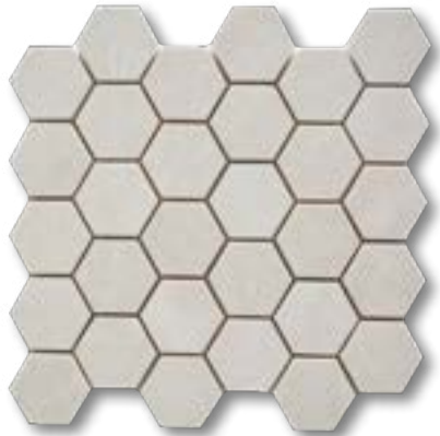
Hexagon French Vanilla