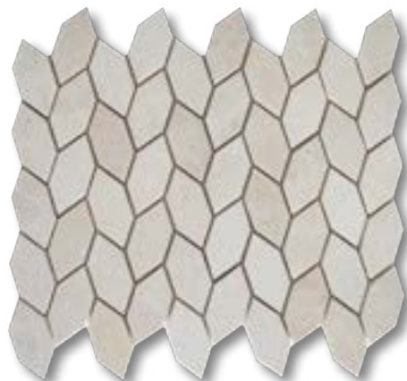
Ivy French Vanilla (H&P)