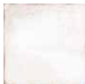
Old White* 5.5" x 5.5" Sq. Ft.: $13.39 SF - Pc.: $2.74 + Freight