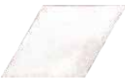
Diamond Old White* 5.5" x 9.5" Sq. Ft.: $17.20 SF - Pc.: $3.08 + Freight