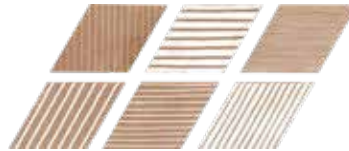
Diamond Paths* 5.5" x 9.5" Sq. Ft.: $18.46 SF - Pc.: $3.31 + Freight *6 pieces random mix ed in box