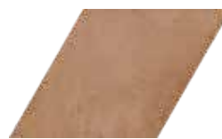
Diamond Terra* 5.5" x 9.5" Sq. Ft.: $17.20 SF - Pc.: $3.08 + Freight