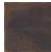
Graphite* 5.5" x 5.5" Sq. Ft.: $13.39 SF - Pc.: $2.74 + Freight