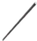
Rounded Edge* 0.43" x 5.5" Pc.: $7.90 + Freight *available in white, terra, teal, boheme, grey and graphite only

*Special order items DO NOT include freight. *Special order items are sold in FULL CARTONS ONLY.