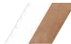
Diamond Pottery* 5.5" x 9.5" Sq. Ft.: $18.46 SF - Pc.: $3.31 + Freight