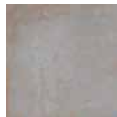
Grey* 5.5" x 5.5" Sq. Ft.: $13.39 SF - Pc.: $2.74 + Freight