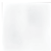
Pure White* 5.5" x 5.5" Sq. Ft.: $13.39 SF - Pc.: $2.74 + Freight