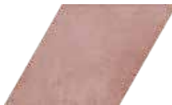
Diamond Boheme* 5.5" x 9.5" Sq. Ft.: $17.20 SF - Pc.: $3.08 + Freight