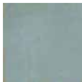
Teal* 5.5" x 5.5" Sq. Ft.: $13.39 SF - Pc.: $2.74 + Freight