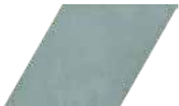
Diamond Teal* 5.5" x 9.5" Sq. Ft.: $17.20 SF - Pc.: $3.08 + Freight