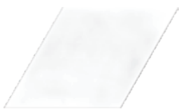
Diamond Pure White* 5.5" x 9.5" Sq. Ft.: $17.20 SF - Pc.: $3.08 + Freight