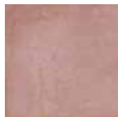
Boheme* 5.5" x 5.5" Sq. Ft.: $13.39 SF - Pc.: $2.74 + Freight