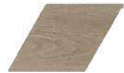
Diamond Wood Mid* 5.5" x 9.5" Sq. Ft.: $17.20 SF - Pc.: $3.08 + Freight