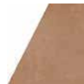
Pottery* 5.5" x 5.5" Sq. Ft.: $14.90 SF - Pc.: $3.05 + Freight