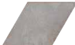
Diamond Grey* 5.5" x 9.5" Sq. Ft.: $17.20 SF - Pc.: $3.08 + Freight