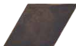
Diamond Graphite* 5.5" x 9.5" Sq. Ft.: $17.20 SF - Pc.: $3.08 + Freight