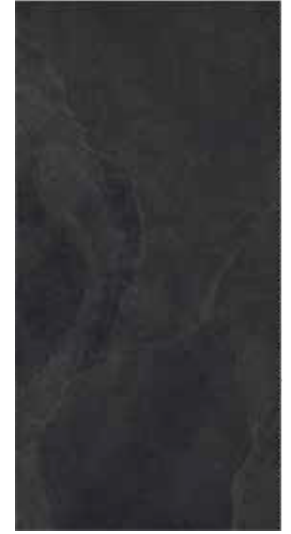
SLAAN1224R Anthracite 12" X 24" Sq. Ft.: $7.98 - PC.: $15.96