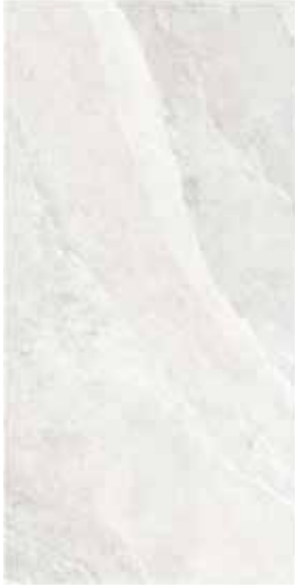
SLAIV1224R Ivory 12" X 24" Sq. Ft.: $7.98 - PC.: $15.96

Unglazed Color-Body Rectified Porcelain Tile