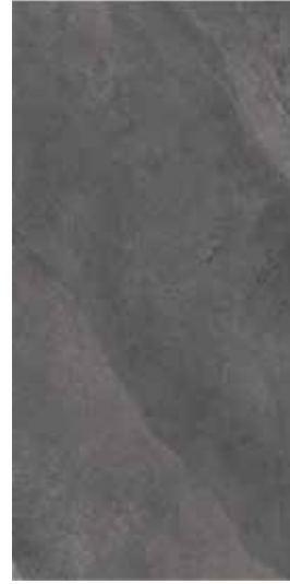
SLADG1224 Dark Grey 12" X 24" Sq. Ft.: $7.98 - PC.: $15.96