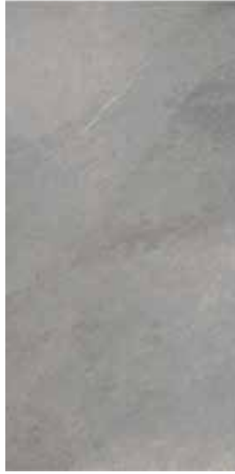
SLAMG1224R Mid Grey 12" X 24" Sq. Ft.: $7.98 - PC.: $15.96