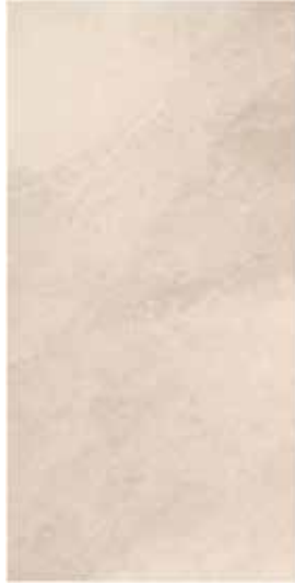
SLAAL1224R Almond 12" X 24" Sq. Ft.: $7.98 - PC.: $15.96