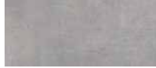
NY02-1224N Portland 12" x 24" Sq. Ft.: $7.95 – Pc.: $15.43