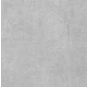
NY01-24N Quicklime 24" x 24" Sq. Ft.: $8.95 – Pc.: $34.73