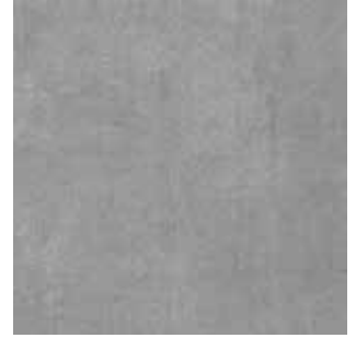
NY02-24N Portland 24" x 24" Sq. Ft.: $8.95 – Pc.: $34.73