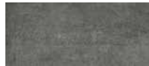
NY06-1224N Shotcrete 12" x 24" Sq. Ft.: $7.95 – Pc.: $15.43