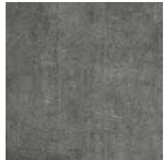
NY06-24N Shotcrete 24" x 24" Sq. Ft.: $8.95 – Pc.: $34.73

12" x 24" Natural packing: 7 pcs. (13.58 sq.ft.) per carton, Weight: 58.31 lbs. per carton 24" x 24" Natural packing: 3 pcs. (11.62 sq.ft.) per carton, Weight: 49.59 lbs. per carton