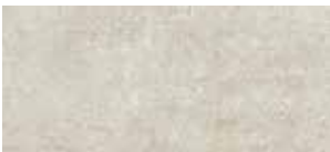
NY05-1224N Talcum 12" x 24" Sq. Ft.: $7.95 – Pc.: $15.43