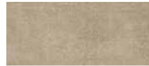
NY04-1224N Parker 12" x 24" Sq. Ft.: $7.95 – Pc.: $15.43