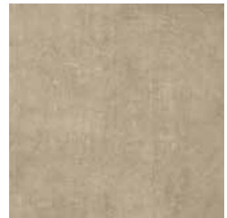
NY04-24N Parker 24" x 24" Sq. Ft.: $8.95 – Pc.: $34.73