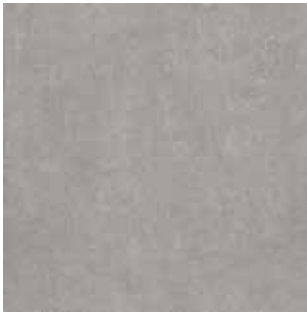
NY03-24N Torching 24" x 24" Sq. Ft.: $8.95 – Pc.: $34.73