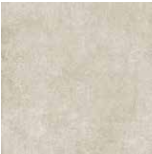
NY05-24N Talcum 24" x 24" Sq. Ft.: $8.95 – Pc.: $34.73