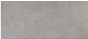
NY03-1224N Torching 12" x 24" Sq. Ft.: $7.95 – Pc.: $15.43