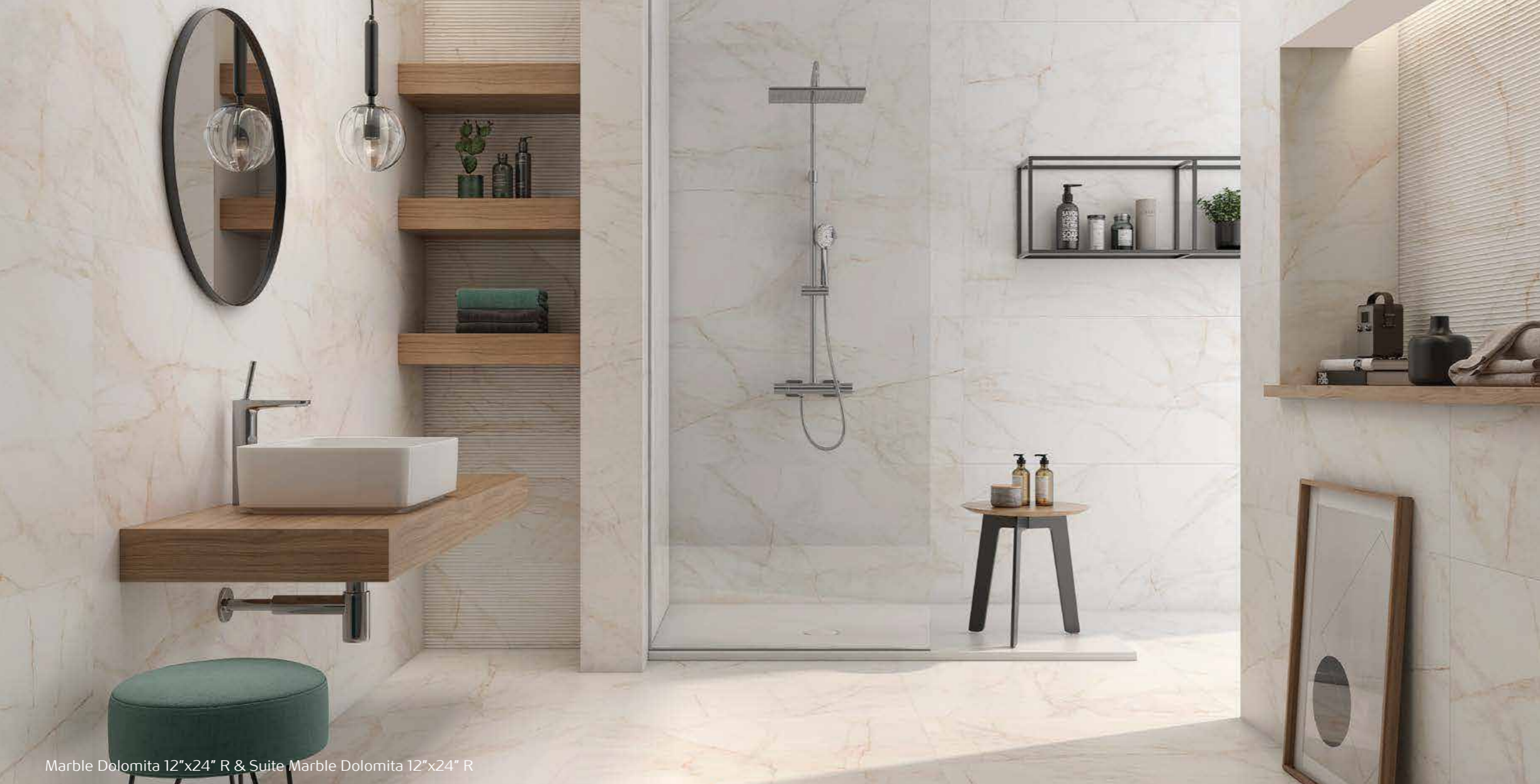
Marble Dolomita 12"x24" R & Suite Marble Dolomita 12"x24" R