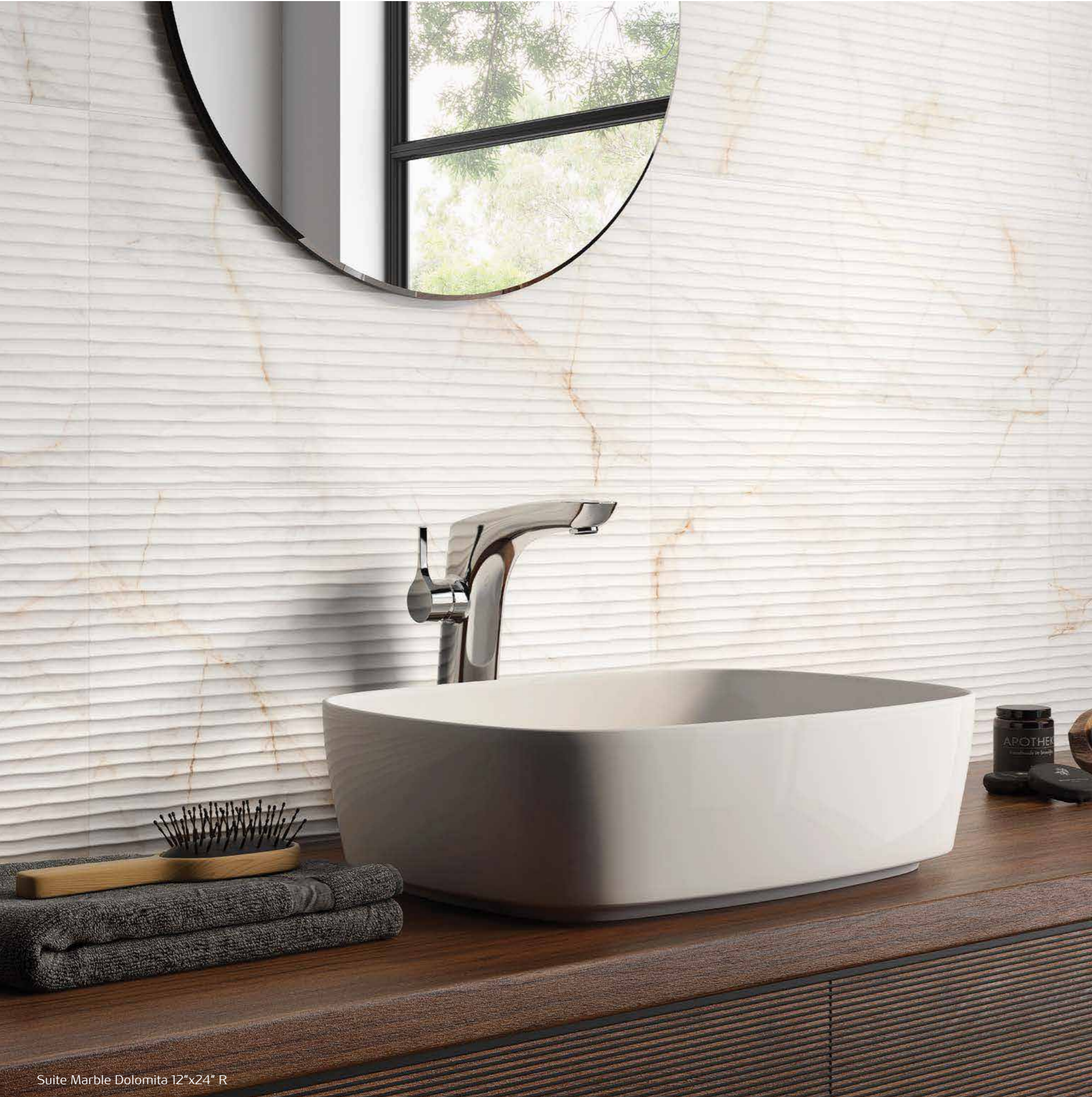
Suite Marble Dolomita 12"x24" R

Dolomita is an advanced material that mimics the tranquility and sophistication of natural stone. Its refined production process yields a marble-like look with shiny copper and soft grey veins on a pearly white base. This blend achieves a visually striking and harmonious appearance.