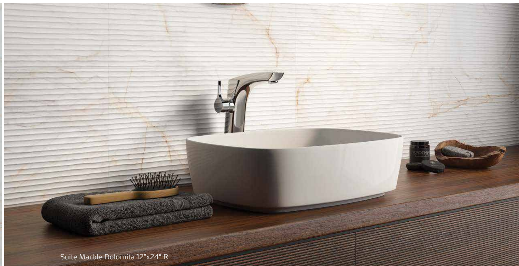
Suite Marble Dolomita 12"x24" R