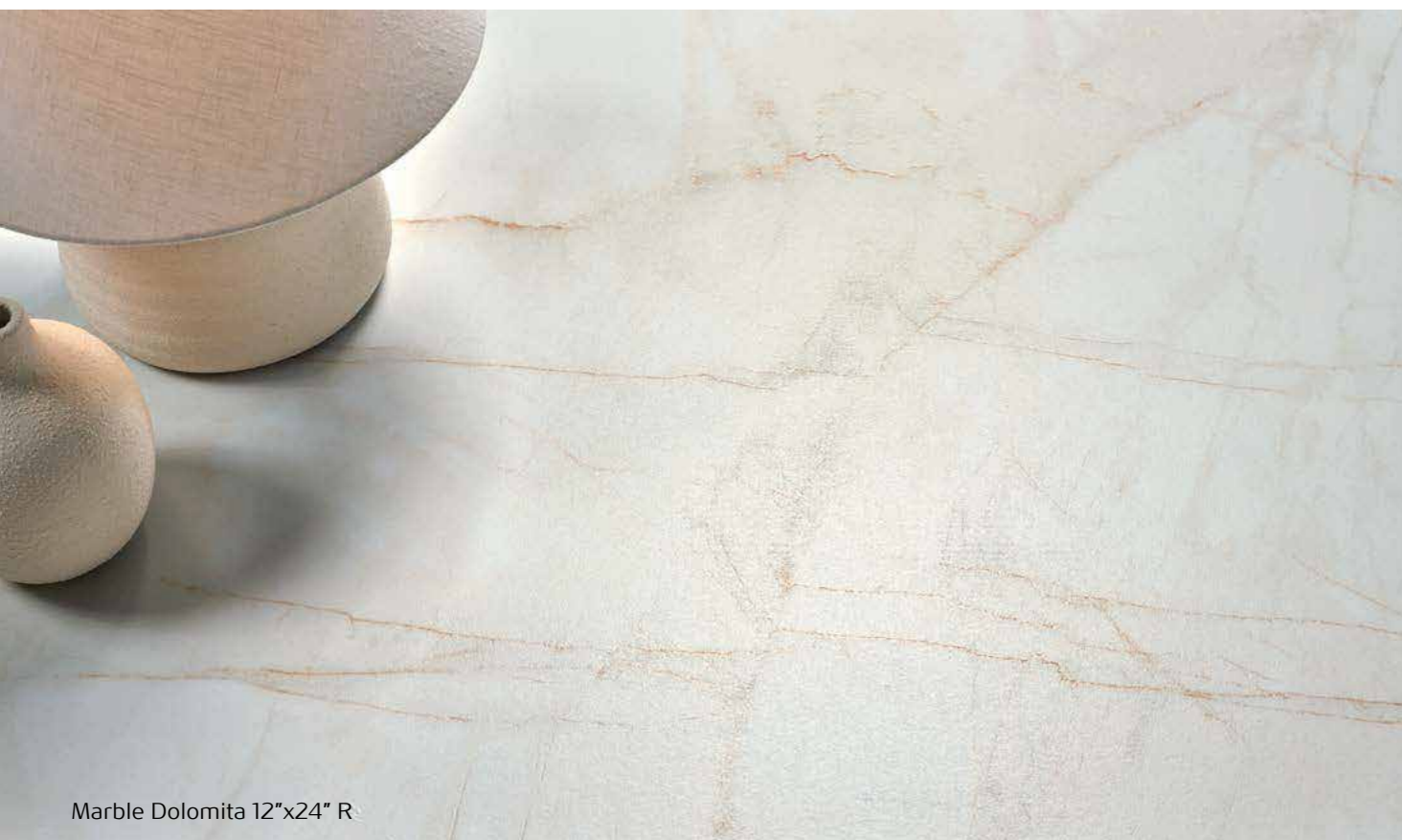
Marble Dolomita 12"x24" R