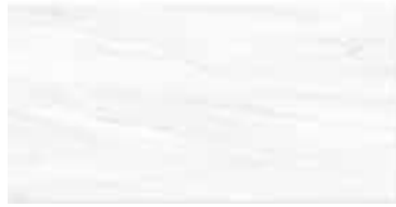
FLWPER5A31 White Polished 12" x 24" Sq. Ft.: $8.29- Pc.: $15.62