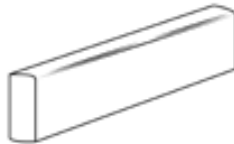
FLWRV04A31 White Bullnose Bright - Wall Only 6" x 18" Pc.: $11.16

12" x 24" Polished packing: 10 pcs. (18.84 sq. ft.) per carton, Weight: 77.55 lbs. per carton 12" x 24" Matte packing: 10 pcs. (20.34 sq. ft.) per carton, Weight: 79.73 lbs. per carton 24" x 48" packing: 3 pcs. (22.93 sq. ft.) per carton, Weight: 84.67 lbs. per carton 13" x 13" mosaic packing: 11 pcs. (13.13 sq. ft.) per carton, Weight: 45.77 lbs. per carton 3" x 12" bullnose packing: 24 pcs. (5.92 sq. ft.) per carton, Weight: 21.43 lbs. per carton 6" x 18" Bright packing: 16 pcs. (11.95 sq. ft.) per carton, Weight: 32.53 lbs. per carton 6" x 18" bullnose packing: 16 pcs. (11.95 sq. ft.) per carton, Weight: 32.59 lbs. per carton