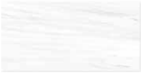
ULAWHPO2448R White Polished 24" x 48" Sq. Ft.: $9.57- Pc.: $73.11