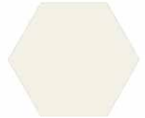
TMAWHHEX Magic White 8" x 9.5" Sq. Ft.: $10.95 – Pc.: $4.93

Packing: 25 pcs. (11.26 sq. ft.) per carton, Weight: 38.5 lbs. per carton