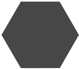
TMABLHEX Magic Black 8" x 9.5" Sq. Ft.: $10.95 – Pc.: $4.93