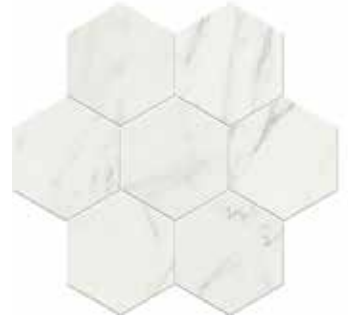
TCOWHHEX Cosmo White 8" x 9.5" Sq. Ft.: $10.95 – Pc.: $4.93 *7 pieces shown*