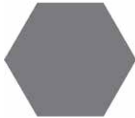
TMAGRHEX Magic Gray 8" x 9.5" Sq. Ft.: $10.95 – Pc.: $4.93