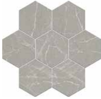
TCOSIHEX Cosmo Silver 8" x 9.5" Sq. Ft.: $10.95 – Pc.: $4.93 *7 pieces shown*