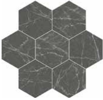
TCOBLHEX Cosmo Black 8" x 9.5" Sq. Ft.: $10.95 – Pc.: $4.93 *7 pieces shown*