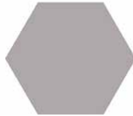
TMASIHEX Magic Silver 8" x 9.5" Sq. Ft.: $10.95 – Pc.: $4.93