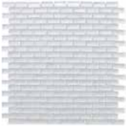
ACBRWH White Brick 0.5" x 1.25" brick - 11.25" X 12" mesh Sq. Ft.: $28.98 - Pc.: $27.34