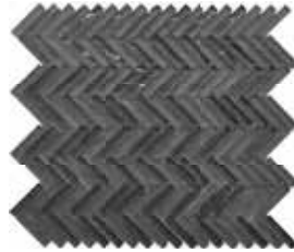
ACHBBL Black Herringbone 0.5" x 2" herring bone - 12" x 12" mesh Sq. Ft.: $28.98 - Pc.: $28.98