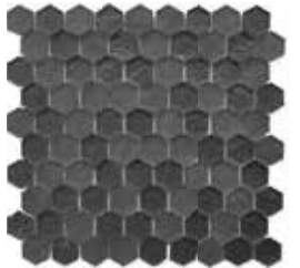
ACHEXBL Black Hexagon 1.25" x 2" hexagon - 11.75" x 12" mesh Sq. Ft.: $39.98 - Pc.: $39.20