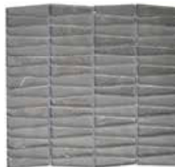
ACTRTA Taupe Trapezoid Trapezoid - 12" X 13" mesh Sq. Ft.: $39.98 - Pc.: $37.02