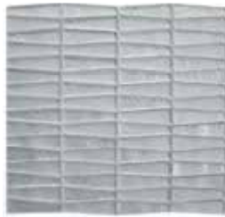
ACTRSI Silver Trapezoid Trapezoid - 12" X 13" mesh Sq. Ft.: $39.98 - Pc.: $37.02