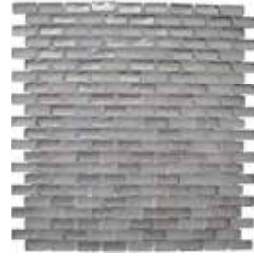
ACBRTA Taupe Brick 0.5" x 1.25" brick - 11.25" X 12" mesh Sq. Ft.: $28.98 - Pc.: $27.34