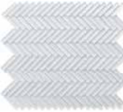
ACHBWH White Herringbone 0.5" x 2" herring bone - 12" x 12" mesh Sq. Ft.: $28.98 - Pc.: $28.98