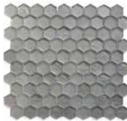
ACHEXTA Taupe Hexagon 1.25" x 2" hexagon - 11.75" x 12" mesh Sq. Ft.: $39.98 - Pc.: $39.20