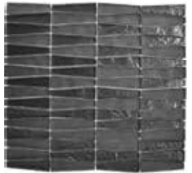
ACTRBL Black Trapezoid Trapezoid - 12" X 13" mesh Sq. Ft.: $39.98 - Pc.: $37.02

0.5" x 1.25" brick packing: 11 pcs. (10.38 sq. Ft.) per carton, 1.06 pcs / sq. Ft. Weight: 3.64 lbs/pc, 40.04 lbs/carton. 0.5" x 2" herring bone packing: 11 pcs. (11 sq. Ft.) per carton, 1 sq. Sq. Ft. Weight: 2.91 lbs/pc, 32.01 lbs/carton. 1.25" x 2" hexagon packing: 11 pcs. (10.78 sq. Ft.) per carton, 1.02 pcs / sq. Ft. Weight: 3.68 lbs/pc, 40.48 lbs/carton. Trapezoid packing: 11 pcs. (11.88 sq. Ft.) per carton, 1.08 sq. Ft./sheet. Weight: 4.09 lbs. Per piece, 44.99 lbs/carton It is recommended that all tile products and related materials be installed as per TCNA Standards