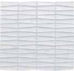
ACTRWH White Trapezoid Trapezoid - 12" X 13" mesh Sq. Ft.: $39.98 - Pc.: $37.02