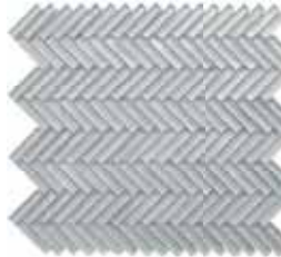
ACHBSI Silver Herringbone 0.5" x 2" herring bone - 12" x 12" mesh Sq. Ft.: $28.98 - Pc.: $28.98