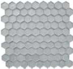
ACHEXSI Silver Hexagon 1.25" x 2" hexagon - 11.75" x 12" mesh Sq. Ft.: $39.98 - Pc.: $39.20