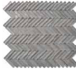
ACHBTA Taupe Herringbone 0.5" x 2" herring bone - 12" x 12" mesh Sq. Ft.: $28.98 - Pc.: $28.98