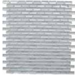
ACBRSI Silver Brick 0.5" x 1.25" brick - 11.25" X 12" mesh Sq. Ft.: $28.98 - Pc.: $27.34