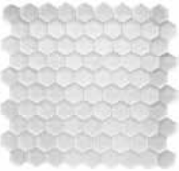
ACHEXWH White Hexagon 1.25" x 2" hexagon - 11.75" x 12" mesh Sq. Ft.: $39.98 - Pc.: $39.20