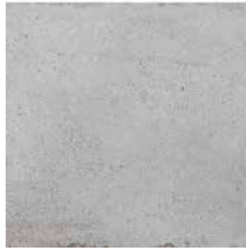
CHAD2G24 Gray 24" x 24" x 20mm Sq. Ft.: $15.00 – Pc.: $58.16