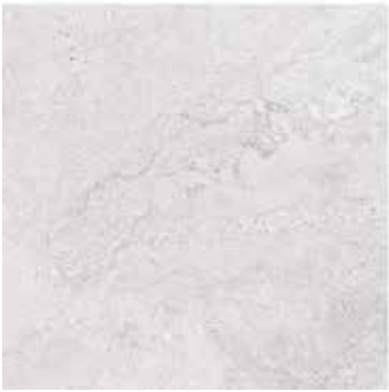
CHAD2W24 White 24" x 24" x 20mm Sq. Ft.: $15.00 – Pc.: $58.16

Color-Body Rectified 20mm Porcelain Pavers