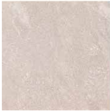
CHAD2B24 BEIGE 24" x 24" x 20mm Sq. Ft.: $15.00 – Pc.: $58.16