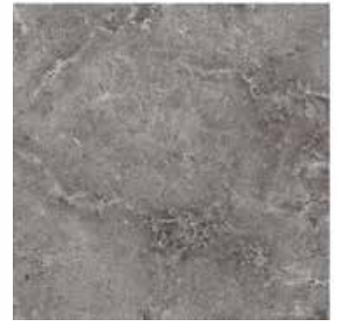
CHAD2DG24 Dark Gray 24" x 24" x 20mm Sq. Ft.: $15.00 – Pc.: $58.16

24" x 24" packing: 2 pcs. (7.75 sq. ft.) per carton, Weight: 71.17 lbs. per carton