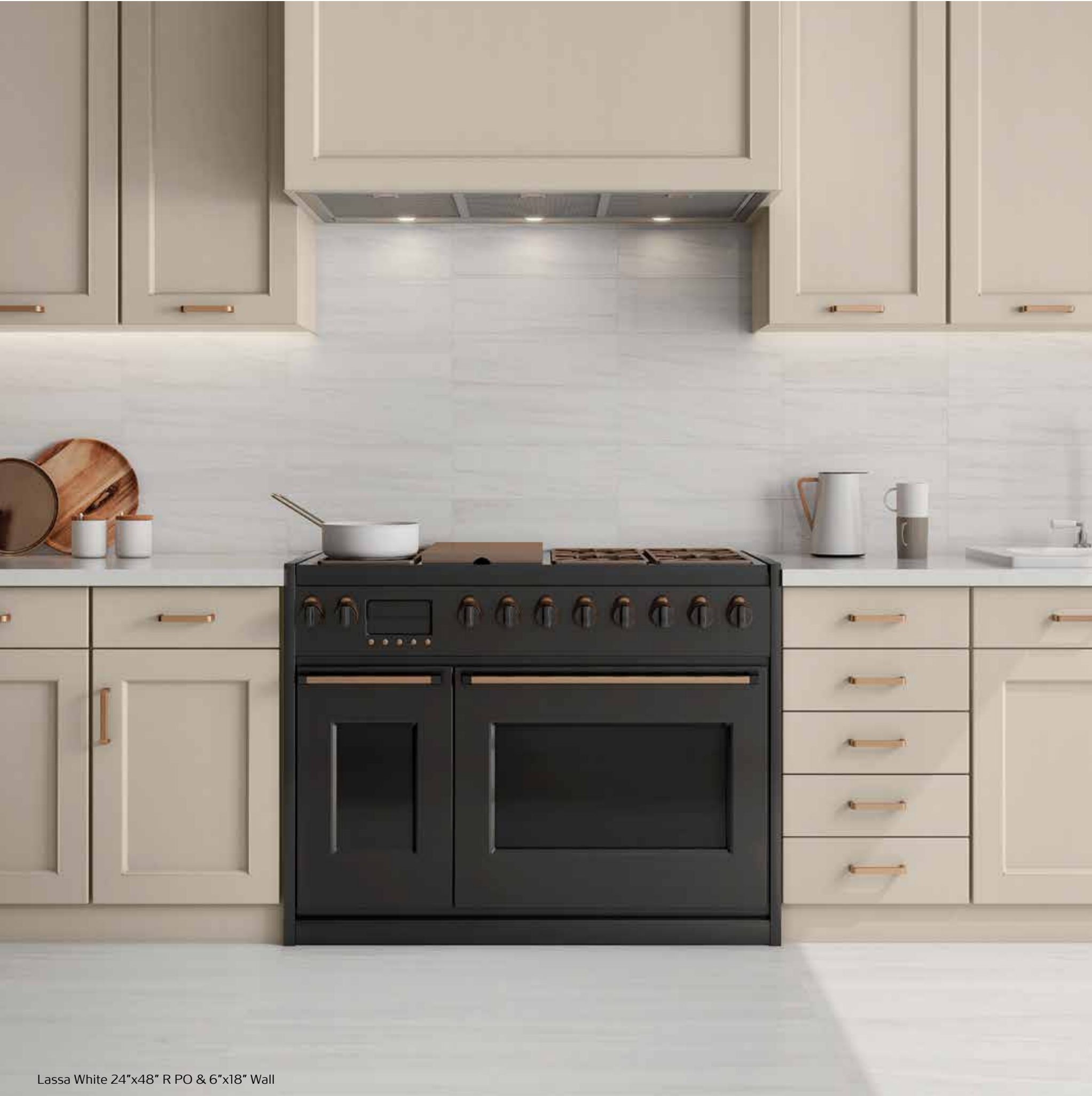
Lassa White 24"x48" R PO & 6"x18" Wall

Lassa White, relaxed and serene beauty, created through the delicate visual interplay of its parallel lines and subtle changes in tone. Its polished finish also brings brightness into designs.