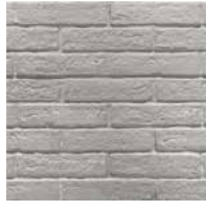
BNYGR210 Grey 2.5" X 10" Sq. Ft.: $10.95 - PC.: $2.13