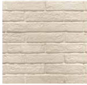
BNYAL210 Almond 2.5" X 10" Sq. Ft.: $10.95 - PC.: $2.13