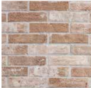
BBRRU210 Rust 2.5" X 10" Sq. Ft.: $10.95 - PC.: $2.13