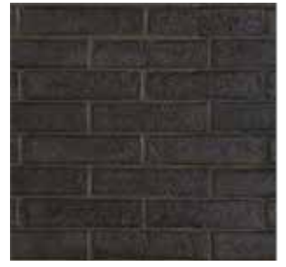
BNYBL210 Black 2.5" X 10" Sq. Ft.: $10.95 - PC.: $2.13