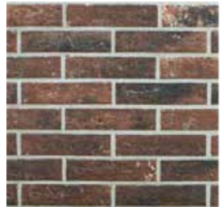
BBRUM210 Umber 2.5" X 10" Sq. Ft.: $10.95 - PC.: $2.13