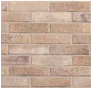
BBRCR210 Cream 2.5" X 10" Sq. Ft.: $10.95 - PC.: $2.13