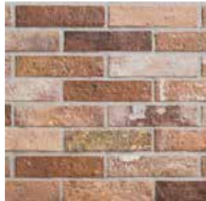
BBRRE210 Red 2.5" X 10" Sq. Ft.: $10.95 - PC.: $2.13