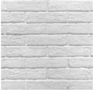
BNYWH210 White 2.5" X 10" Sq. Ft.: $10.95 - PC.: $2.13