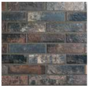
BBRDA210 Dark 2.5" X 10" Sq. Ft.: $10.95 - PC.: $2.13