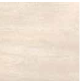
ALBE180 Beige 24" X 24" Sq. Ft.: $6.98 – Pc: $27.36