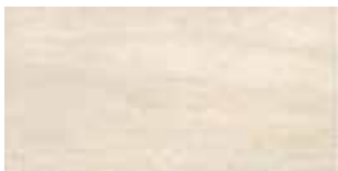
ALBE160 Beige 12" x 24" Sq. Ft.: $5.98 – Pc. $11.66