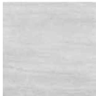
ALAR180 Argento 24" X 24" Sq. Ft.: $6.98 – Pc: $27.36