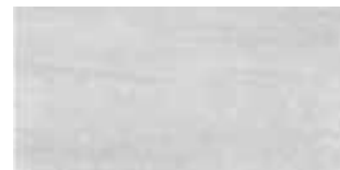
ALAR160 Argento 12" x 24" Sq. Ft.: $5.98 – Pc. $11.66