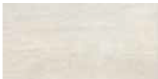
ALAL160 Almond 12" x 24" Sq. Ft.: $5.98 – Pc. $11.66