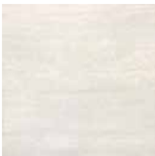
ALAL180 Almond 24" X 24" Sq. Ft.: $6.98 – Pc: $27.36