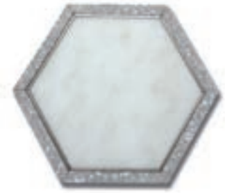
Next Hex Carrara Bella (H) w/ Gray Terrazzo & Stainless Steel MB1604-HEX8H2