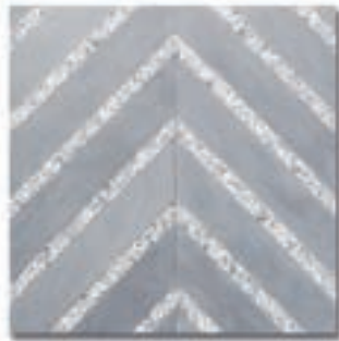
Next Arrow Ombra (H) w/ Shadow Terrazzo MB2426-0909H0