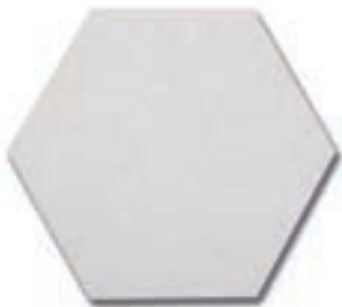
Next Hex Thassos (H) MB1232-HEX8H0