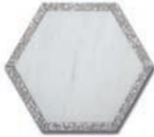
Next Hex Carrara Bella (H) w/ Gray Terrazzo MB1604-HEX8H1