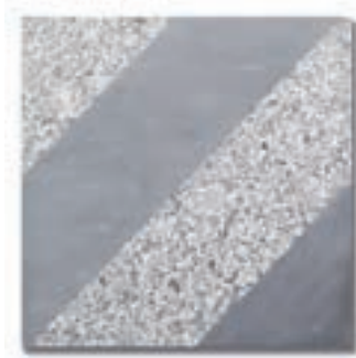
Next Diagonal Ombra (H) w/ Shadow Terrazzo MB2426-0808H0