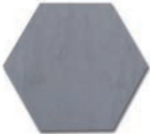
Next Hex Ombra (H) MB2426-HEX8H0