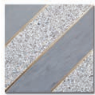
Next Diagonal Ombra (H) w/ Shadow Terrazzo & Brass MB2426-0808H1