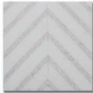
Next Arrow Thassos (H) w/ White Terrazzo MB1232-0909H0