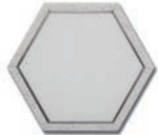
Next Hex Thassos (H) w/ White Terrazzo & Stainless Steel MB1232-HEX8H2