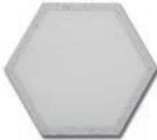
Next Hex Thassos (H) w/ White Terrazzo MB1232-HEX8H1