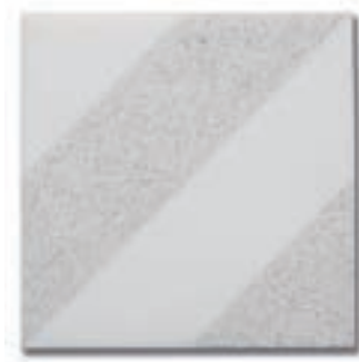
Next Diagonal Thassos (H) w/ White Terrazzo MB1232-0808H0