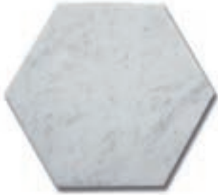
Next Hex Carrara Bella (H) MB1604-HEX8H0