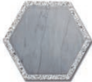
Next Hex Ombra (H) w/ Shadow Terrazzo MB2426-HEX8H1