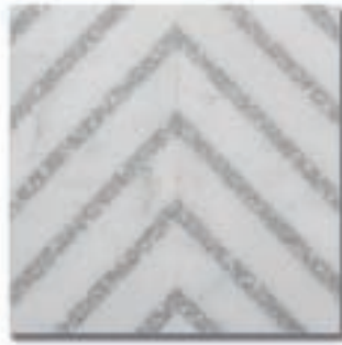
Next Arrow Carrara Bella (H) w/ Gray Terrazzo MB1604-0909H0