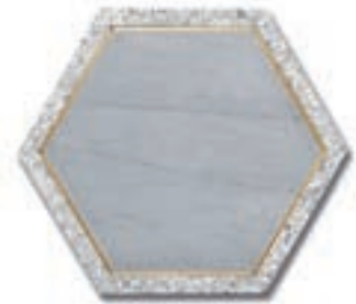
Next Hex Ombra (H) w/ Shadow Terrazzo & Brass MB2426-HEX8H2