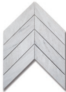
Rise Ash Gray (H & Combed) MB1809-RISEHO

Product shown on previous spread: Shine Calacatta (H) with Gold Product shown: Rise Thassos (H) with Silver (Combed)