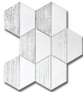
Daybreak Thassos (H) with Silver (Combed) MB1232-DAYBHO