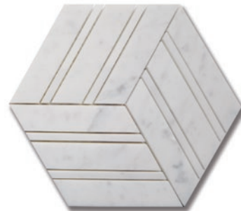
Shine Carrara (H & P) MB1130-SHNEHO