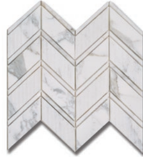
Ray Calacatta (H, P and Combed) MB1203-RAYOH1