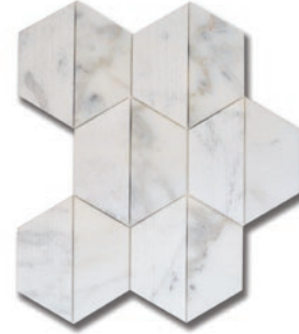
Daybreak Calacatta (H & Combed) MB1203-DAYBH1