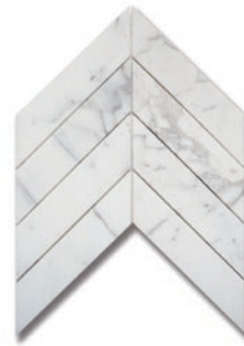
Rise Calacatta (H & Combed) MB1203-RISEH1