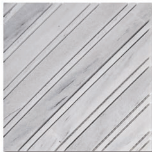
Beam Ash Gray (H&P) MB1809-DS0800