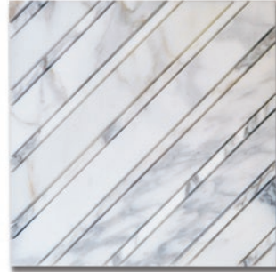
Beam Calacatta (H&P) MB1203-DS0801