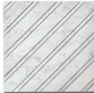
Beam Carrara (H&P) MB1130-DS08H0