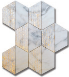
Daybreak Calacatta (H) with Gold (Combed) MB1203-DAYBHO