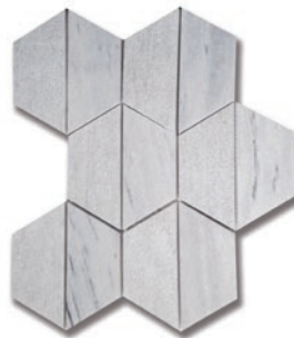
Daybreak Ash Gray (H & Combed) MB1809-DAYBHO