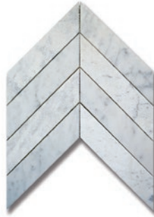
Rise Carrara (H & Combed) MB1130-RISEHO