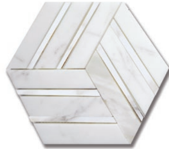
Shine Calacatta (H & P) MB1203-SHNEHO