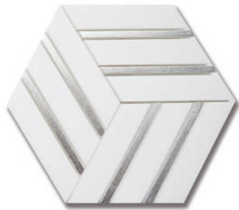
Shine Thassos (H) with Silver MB1232-SHNEHO