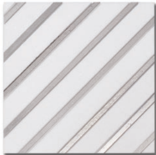
Beam Thassos (H) with Silver MB1232-DS08H0