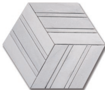
Shine Ash Gray (H & P) MB1809-SHNEHO