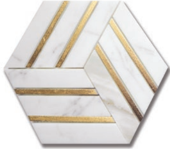
Shine Calacatta (H) with Gold MB1203-SHNEH1