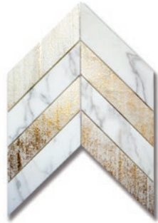
Rise Calacatta (H) with Gold (Combed) MB1203-RISEHO