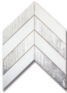
Rise Thassos (H) with Silver (Combed) MB1232-RISEHO