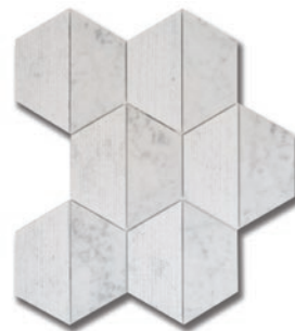
Daybreak Carrara (H & Combed) MB1130-DAYBHO