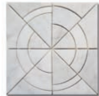
Architetto Compasso Carrara Bella (H&SB) MB1604-COMP00