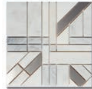
Architetto Angolo Carrara Bella (H) w/ Stainless Steel MB1604-ANGOH1