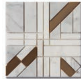
Architetto Angolo Calacatta (H) w/ Brass MB1203-ANGOH1