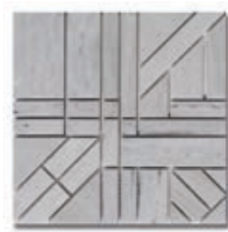
Architetto Angolo Ash Gray (H) MB1809-ANGOHO