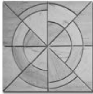
Architetto Compasso Ash Gray (H&SB) MB1809-COMP00