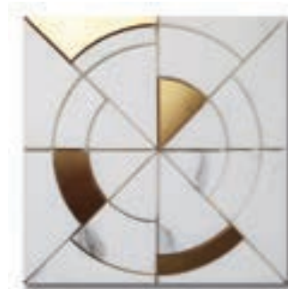
Architetto Compasso Calacatta (H) w/ Brass MB1203-COMPH0