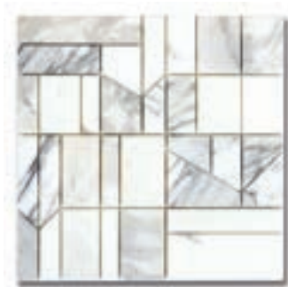
Architetto Modulo Calacatta (H&P) MB1203-MODU00