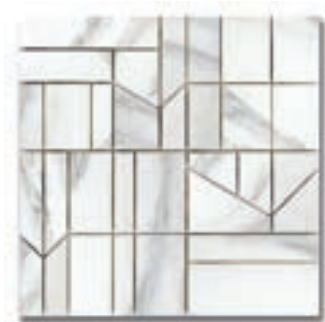
Architetto Modulo Carrara Bella (H&P) MB1604-MODU00