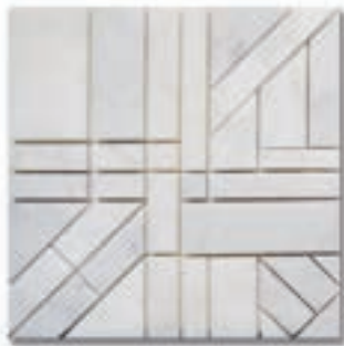
Architetto Angolo Carrara Bella (H) MB1604-ANGOHO