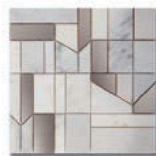
Architetto Modulo Carrara Bella (H) w/ Stainless Steel MB1604-MODUH0