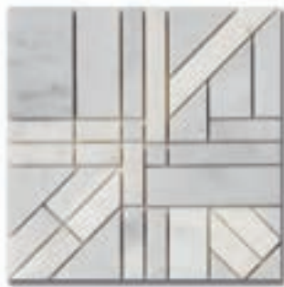
Architetto Angolo Calacatta (H) MB1203-ANGOHO