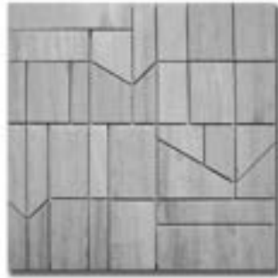
Architetto Modulo Ash Gray (H&P) MB1809-MODU00