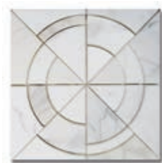
Architetto Compasso Calacatta (H&SB) MB1203-COMP00